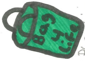
A Plastic bag